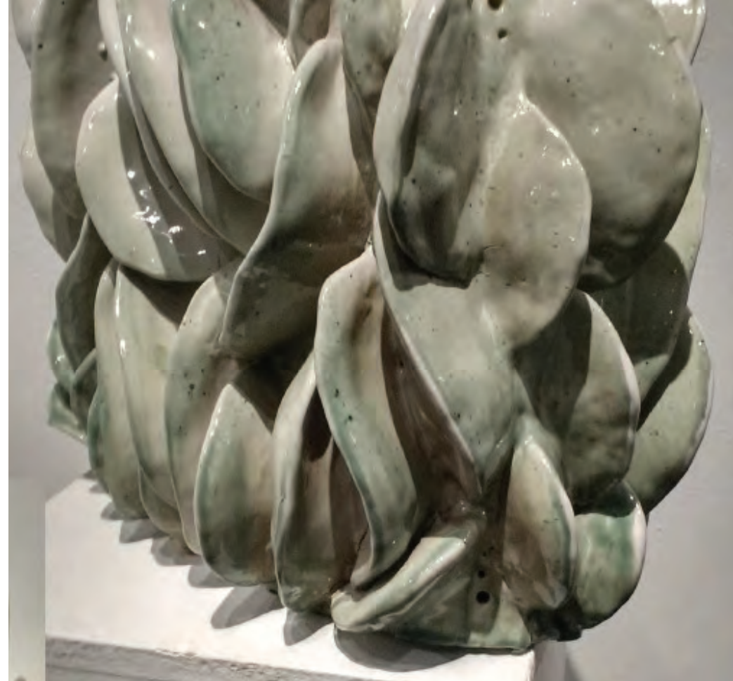
NAME: Sea Rhythms SIZE: 80 cm x 50 cm x 30cm MATERIAL: Stoneware with light green glaze