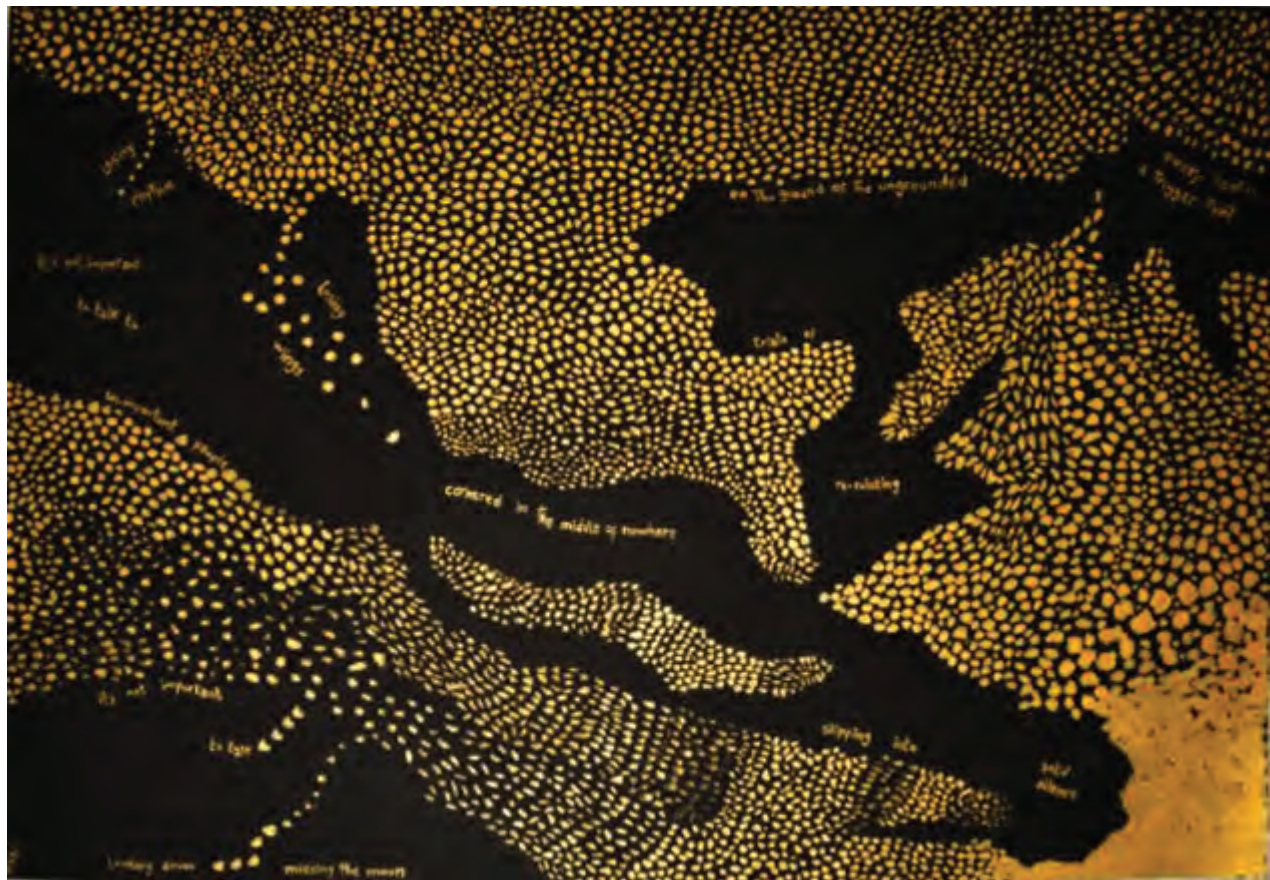
NAME: Mapping Silence SIZE: 100 cm x 70 cm MATERIAL: Acrylic on paper